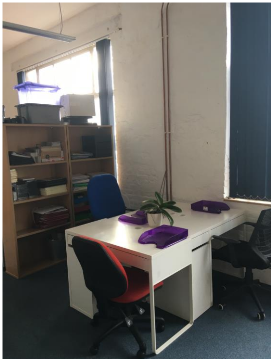
Desks and book shelves